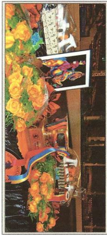
Show Ring Illustration for Champions Awards Presentation